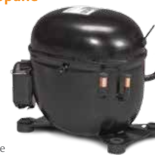
Model ASE — R-290 compressor