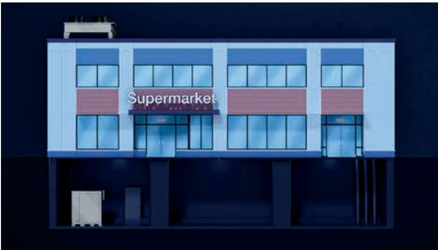
split indoor/outdoor installation