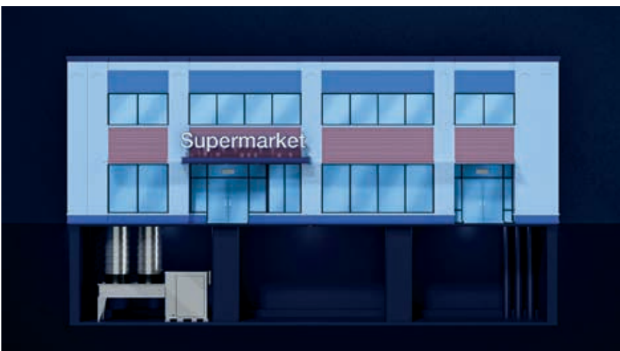
packaged indoor installation