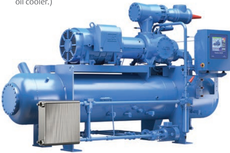
Figure 2: A single-screw compressor with a water-cooled oil cooler

Most screw compressors require oil injection. They use a sizeable oil cooling system, i.e., the oil that is injected is used and then recovered in an oil separator. The oil goes through an oil cooler to cool it back down to a lower injection temperature, and then the oil gets injected back into the compressor. By using a single-screw compressor, additional heat can be acquired for use elsewhere. (Figure 2 is an example of a single-screw compressor with a water-cooled oil cooler.)