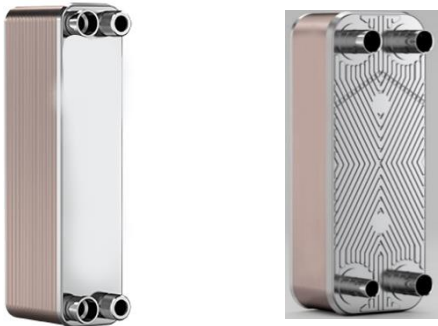
Heat exchanger B8T Heat exchanger BX4T

In addition to the above, we will be upgrading the heat exchanger used on 50Hz H series condensing units from model 'B8T' to 'BX4T'. This change will not have any effect on the performance of H series condensing units.